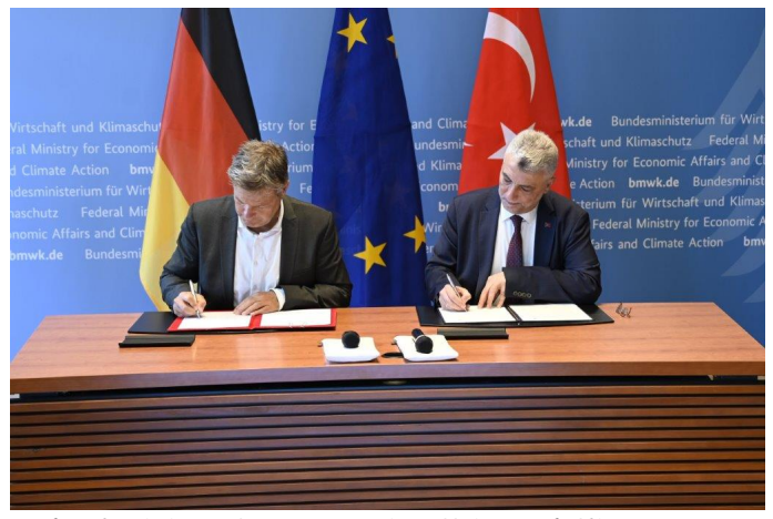
Federal Minister for Economic Affairs and Climate

Habeck emphasised: "Germany and Türkiye have entertained diplomatic relations for exactly a century. Our trade, and the large numbers of entrepreneurs operating in the other respective country have very often been a motor for an intensive exchange. Our trading volume grew to reach 55 billion euros last year – the highest number in our trade history. The EU-Türkiye trade discussions and the agreement for Türkiye to participate in the Partnering in Business with Germany will strengthen this development even further."